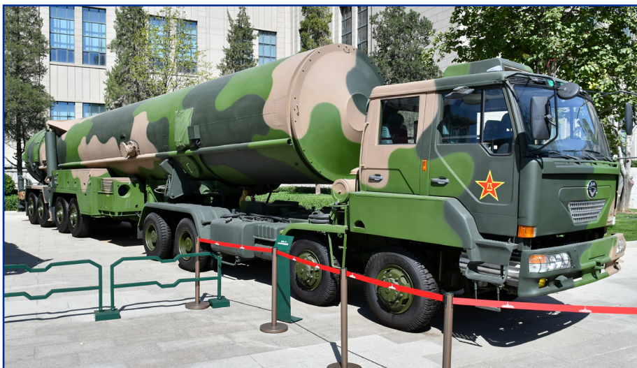
Chinese DF-31 Ballistic Missile

Today's strategic environment is dynamic, complex, and volatile. For decades, we held a military advantage over our adversaries, both from a nuclear and conventional standpoint. That is still true today, but it is rapidly changing. Globally, adversaries are openly challenging the international order through aggression, coercion, and subversion, and our Allies and partners are looking to us for leadership and security.