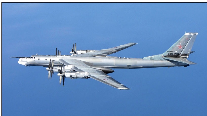
Russian TU-95 BEAR

One of our biggest challenges in the future will be gaining and maintaining freedom of action as our adversaries' capabilities rapidly advance. Advancing technologies can be an opportunity or threat. For example, for decades the U.S. enjoyed unimpeded freedom of action in the space domain. Today's space capabilities empower the Joint Force to operate globally with unmatched speed, agility, and lethality. Our adversaries understand this and are working hard to erode that advantage.